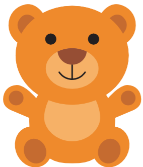
xiǎo xióng 小熊