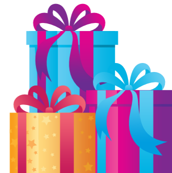
lǐ wù 礼物