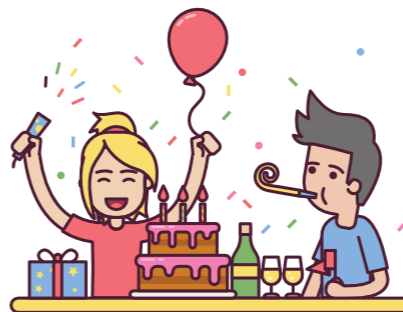
shēng rì huì 生日会