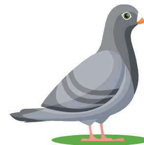
gē zi 鸽子