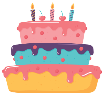
dàn gāo 蛋糕