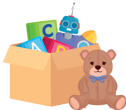
wán jù 玩具