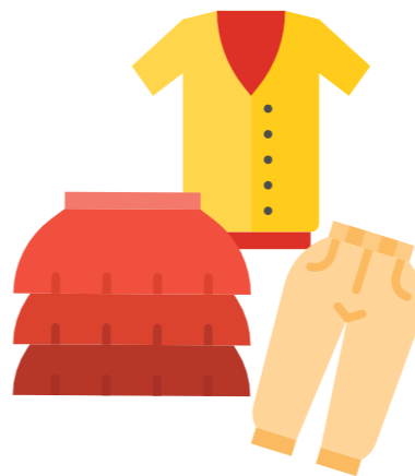
yī fu 衣服